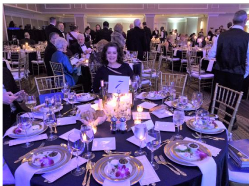
January 20: Tricia O'Hara graces Table 7 at an Inaugural Ball on January 20. (Photo provided by Tricia).