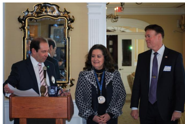
3/22: Meet 'n' Greet : Once again held at the Westin Arlington Gateway. See photo below: