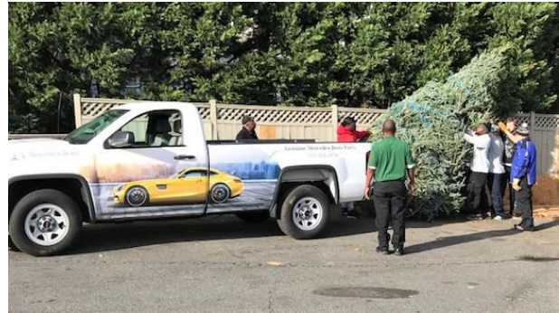
Below, two Nov. 28 unloading photos