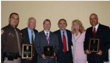
Arlington Police Awards 6-06