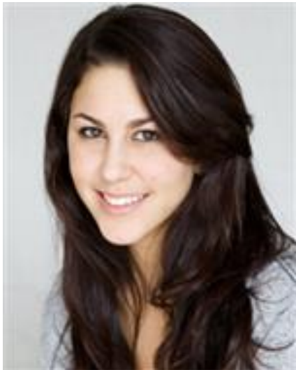
Olympian Julie Zetlin 7-18