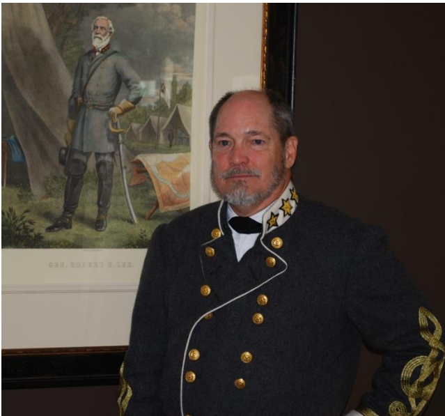
General Joseph E. Johnston 8-15